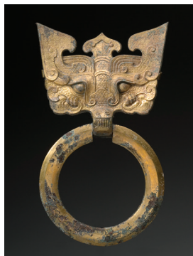
Escutcheon and Ring Handle, Han Dynasty (206 B.C.E.–220 C.E.)