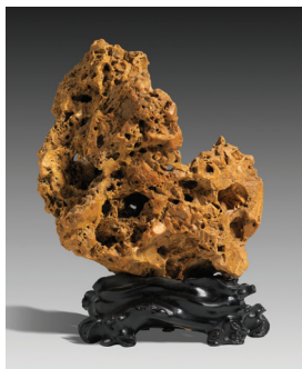
Fantastic Rock, Qing Dynasty (1644–1911)