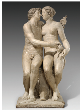
Atalanta and Meleager with the Calydonian Boar, ca. 1564–1565 Francesco Mosca