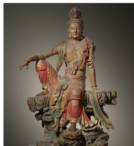
The Bodhisattva Guanyin of the Southern Sea Liao (907–1125) or Jin Dynasty (1115–1234)