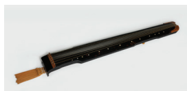
Qin (Zither), 1800 Kimura Kōshō