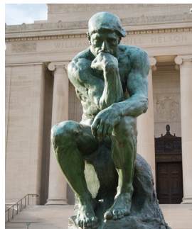
The Thinker, 1880 Auguste Rodin

Donald J. Hall Sculpture Park, outside south doors