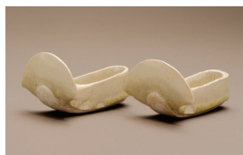
Miniature pair of slippers, Sui Dynasty (581–618 C.E.)