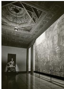
Ceiling Vault, Chinese Temple, 1444